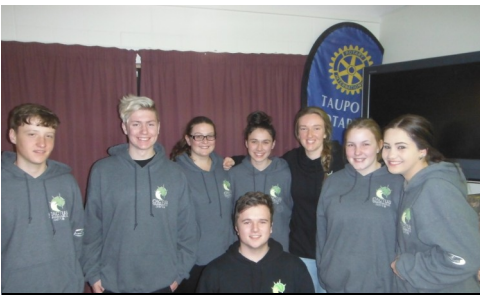
Members of the CACTUS Team Tauhara College 2016